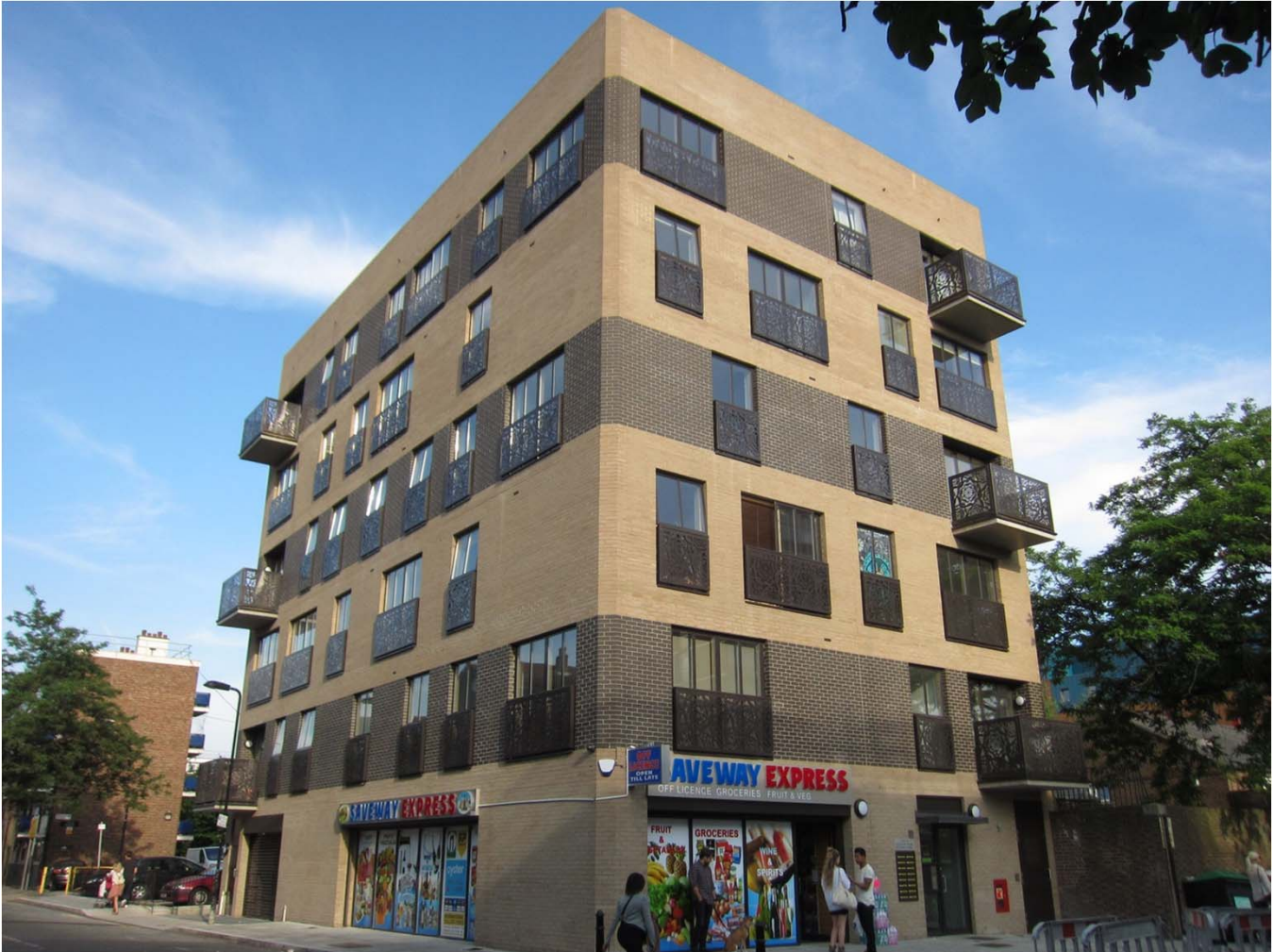
Pitfield Street, N1